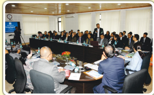
Sensitization programme in progress