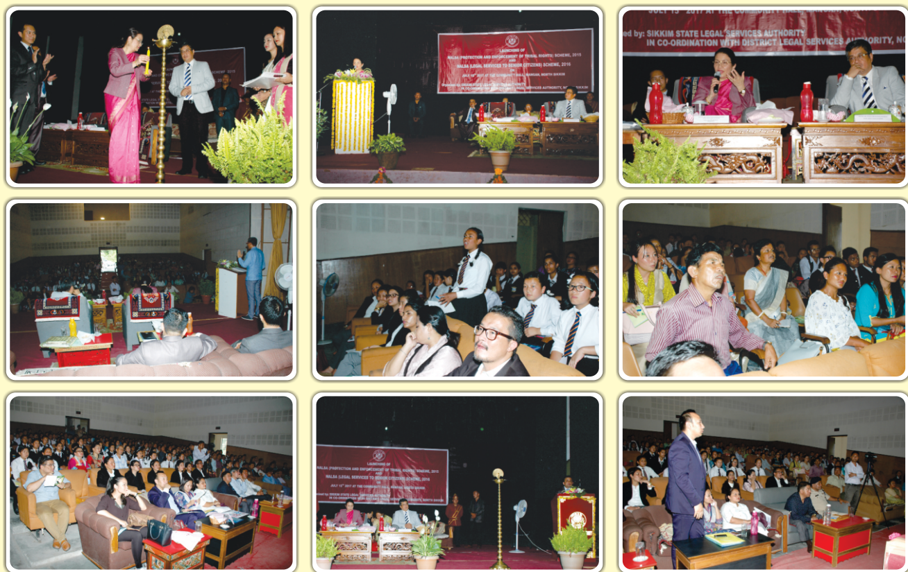
Glimpses of the programme

Apart from the two Schemes launched, the Resource Persons deliberated on Sikkim Anti-Drugs Act, 2006 and Welfare Schemes of the Central/State Government for Senior Citizens, Women and Children.