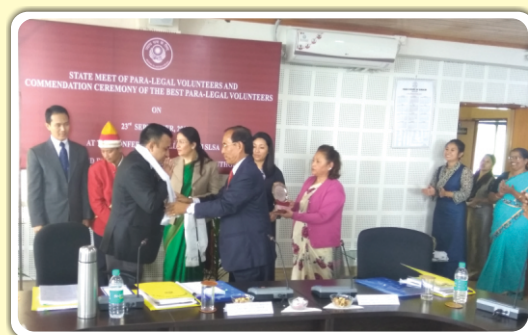
Glimpses of the programme