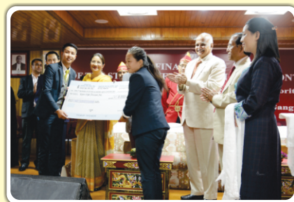
Prize distribution to the winners of the Academic Quiz Contest