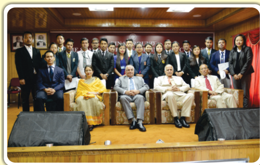
Hon'ble dignitaries with the participants