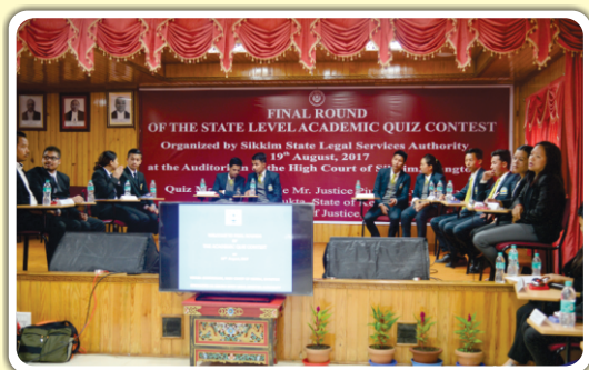
The final round of the Academic Quiz Contest